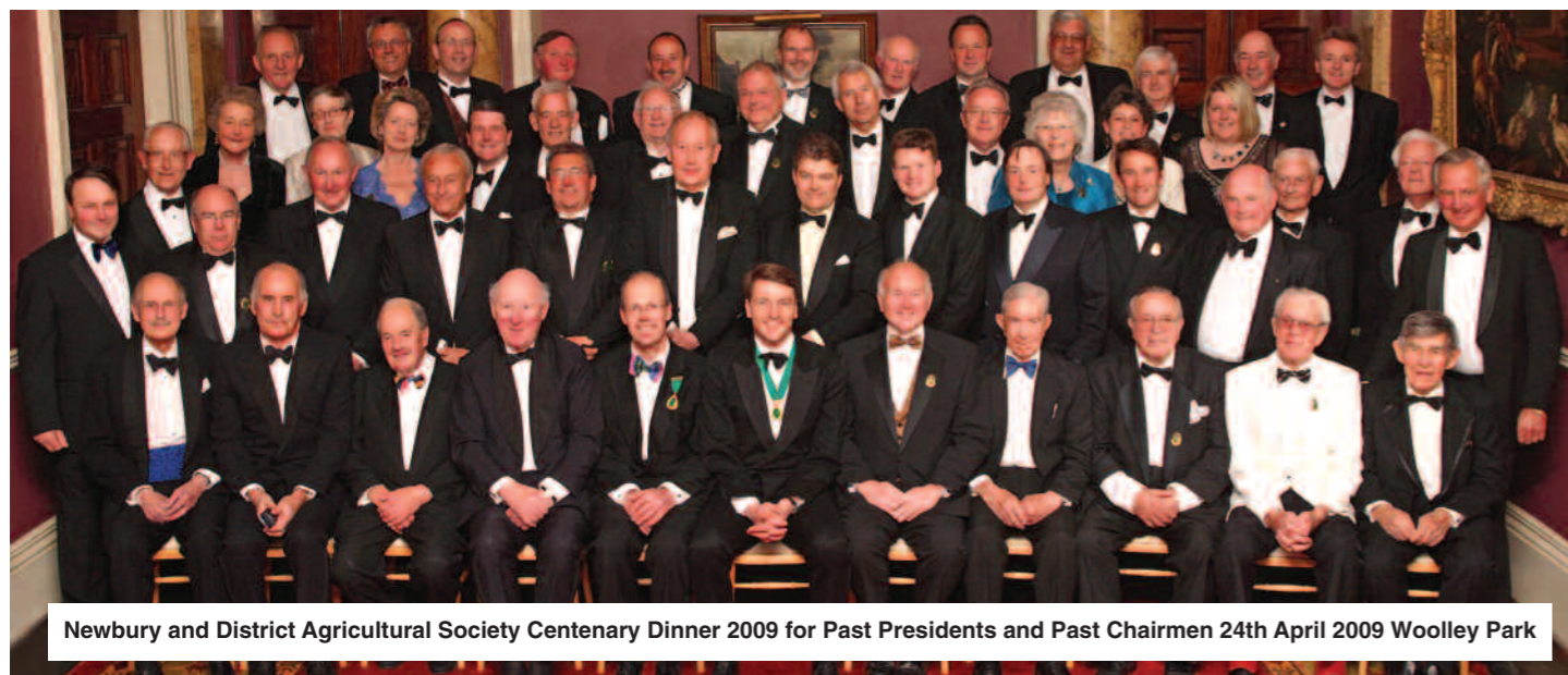
Newbury and District Agricultural Society Centenary Dinner 2009 for Past Presidents and Past Chairmen 24th April 2009 Woolley Park

In recent years the Society has considered extending to a Three Day Show but so far has decided to keep it as a two day Show. Considerations being significantly increased costs, whether all livestock would be there for the three days and also the need to recruit additional volunteer stewards.